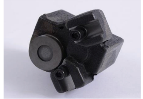
Typical Guide Block