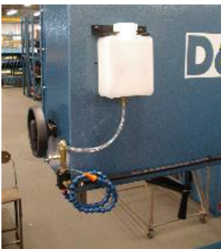
Mist Lubricator – 420288