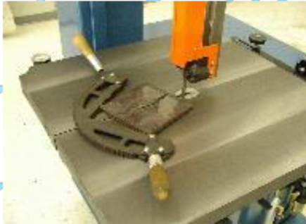
Work Holding Jaw - 5-013007