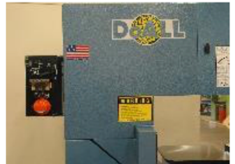
Blade Welder – 299550/299551