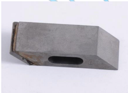
Typical Guide Insert