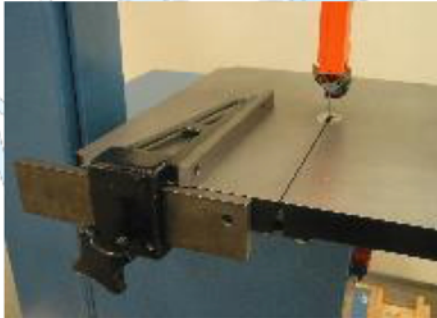
Rip Fence – 47779