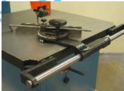
Mitering Attachment – 55305