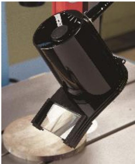
Magnifying Attach – 138436