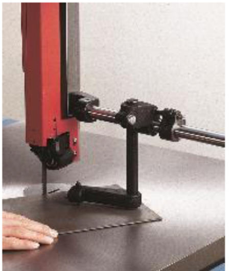
Disk Cutting - 402080