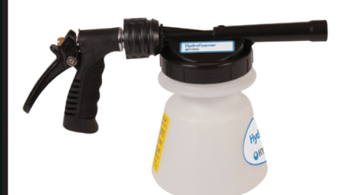
Hydro Systems Hydro Foamer Durable, low-cost dispenser for Master STAGES™ maintenance cleaners produces foaming stream for cleaning machine tools or large clean-in-place parts.

Mini Dos Compact, low- to mid-flow, fluid-driven proportional injector. Segregates harsh chemicals from critical internal components.