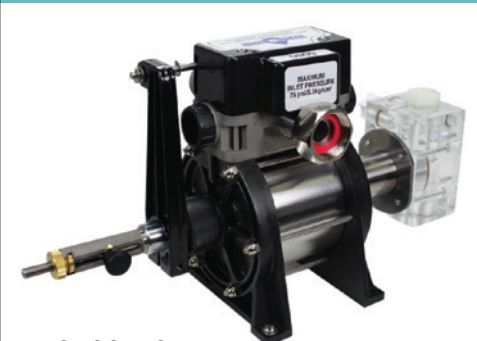
Hydroblend <sup>®</sup> Water-driven, positive displacement proportioner dispenses coolant concentration on demand. Option for alkaline parts washing.

SmartSkim<sup>®</sup> Sump Caddy™ Effectively removes troublesome tramp oil from coolant for longer sump and tool life, better surface finish, and cleaner machines and workplace.