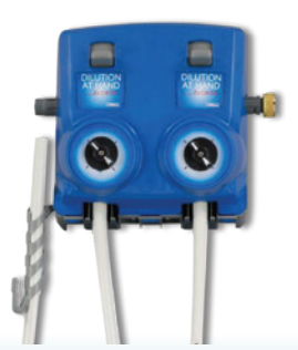
Dema Cleaner Mixer Easily mix cleaners for maintenance tasks with up to 8 different concentrations via selectable dials.